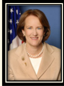
Karen Mills Administrator U.S. Small Business Administrator